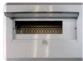
20-Way Flush Mounted