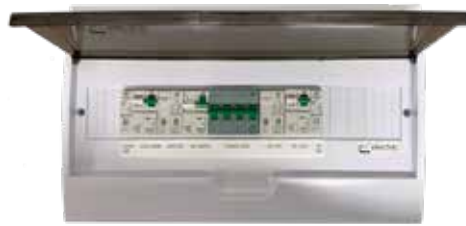
DIN Solar DB