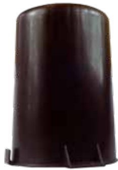
Plastic Pole Mounting Box