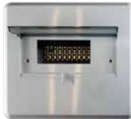
12-Way Flush Mounted

Other variations available on request, including a CFL (energy saver) version bulkhead. Excludes bulb.